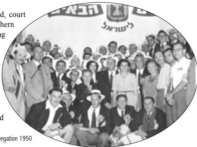
South African Maccabiah Delegation 1950