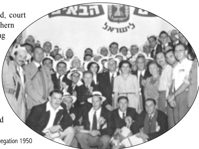
South African Maccabiah Delegation 1950