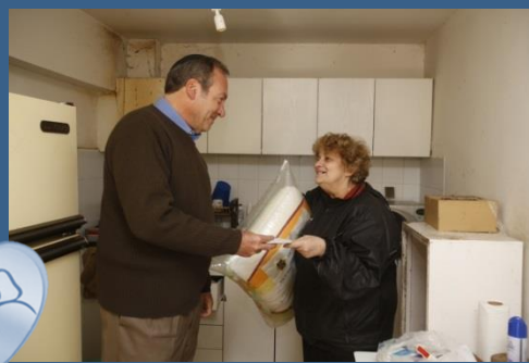
Keren Telfed - a self-help fund 'of the community, by the community, for the community'.